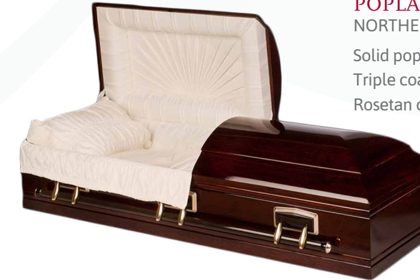
CARTER SOLID POPLAR NORTHERN 228DW Solid poplar construction Triple coat, gloss finish Rosetan crepe interior