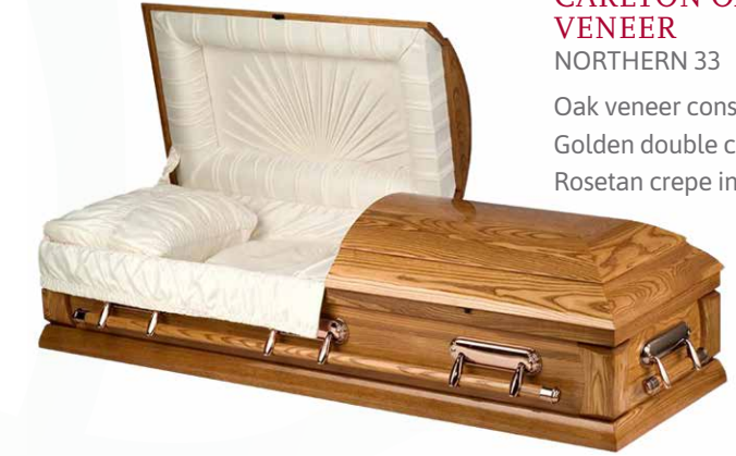
CARLTON OAK VENEER NORTHERN 33 Oak veneer construction Golden double coat finish Rosetan crepe interior