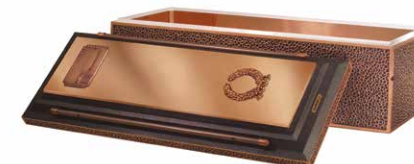
LYDIAN COPPER SUPERIOR Reinforced concrete ABS and Copper liner Butyl sealing tape