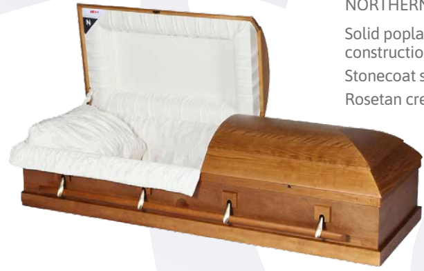
MORDEN SOLID POPLAR VENEER NORTHERN 446 Solid poplar and veneer construction Stonecoat satin finish Rosetan crepe interior