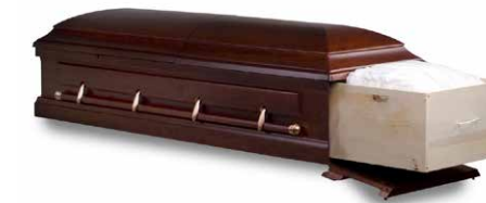
NORTHERN FRONTENAC RENTAL NORTHERN 18 $1,640