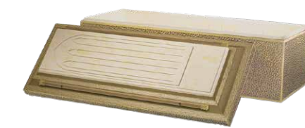
PATRICIAN SUPERIOR Reinforced concrete ABS liner Butyl sealing tape Gothic window design Available in Gold or Black & Silver