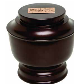
ANDOVER MOCHA DODGE 956900