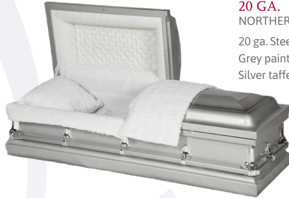
NEWPORT SILVER 20 GA. NORTHERN 204 20 ga. Steel construction Grey painted finish Silver taffeta interior