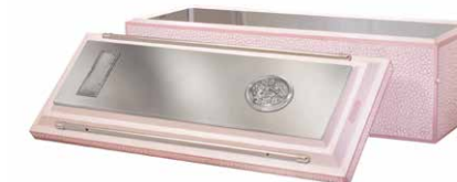
ATHENIAN ROSE SUPERIOR Reinforced concrete ABS and Steel liner Butyl sealing tape Available in Black and Silver