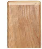
NORTHERN 201 NORTHERN 201 Solid ash 6X6X8.5 in $295