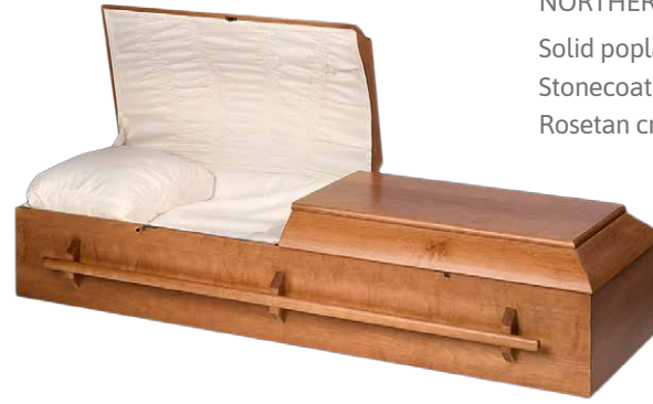
ALDERGROVE SOLID POPLAR NORTHERN 428 Solid poplar construction Stonecoat satin finish Rosetan crepe interior