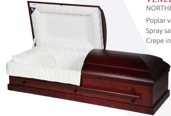
NORWAY POPLAR VENEER NORTHERN 526M Poplar veneer construction Spray satin finish Crepe interior