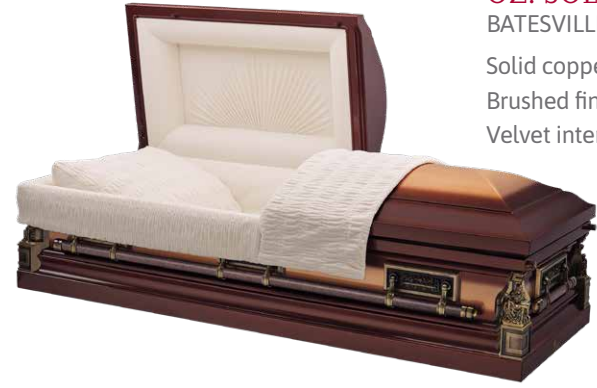
MEDITERRANEAN 32 OZ. SOLID COPPER BATESVILLE 147930 Solid copper construction Brushed finish Velvet interior