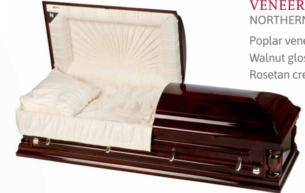
MINTO POPLAR VENEER NORTHERN 632 Poplar veneer construction Walnut gloss finish Rosetan crepe interior