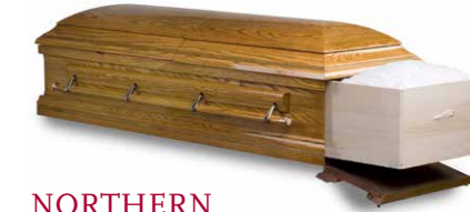
NORTHERN CAMBRIAN RENTAL NORTHERN 23 $1,650