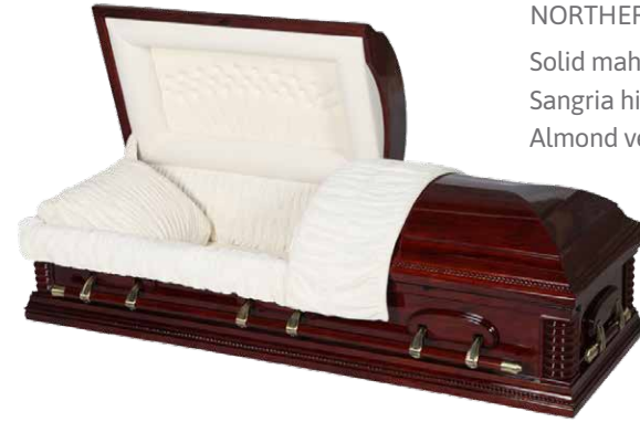
WESTMINSTER SOLID MAHOGANY NORTHERN NL01 Solid mahogany construction Sangria high gloss finish Almond velvet interior