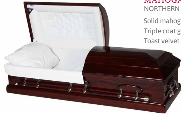
VERSAILLES SOLID MAHOGANY NORTHERN 979 Solid mahogany construction Triple coat gloss finish Toast velvet interior