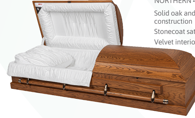
BRETON SOLID OAK NORTHERN 445 Solid oak and veneer construction Stonecoat satin finish Velvet interior