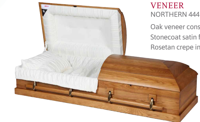
GLENTAY OAK VENEER NORTHERN 444 Oak veneer construction Stonecoat satin finish Rosetan crepe interior