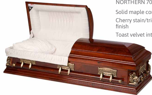
PIETA SOLID MAPLE NORTHERN 709 Solid maple construction Cherry stain/triple coat gloss finish Toast velvet interior