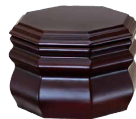
OGEE CHERRY COMMEMORATE A204

The cemetery remains the safest place for the burial of a loved one, even after cremation. A cemetery is protected property in perpetuity and allows for a permanent memorial for your loved one. Urn burial remains a meaningful way to lay a loved one to rest.