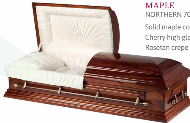
HOMESTEAD SOLID MAPLE NORTHERN 707 Solid maple construction Cherry high gloss finish Rosetan crepe interior