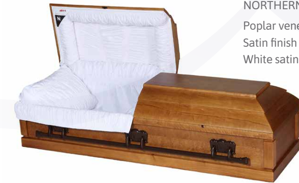
DURHAM POPLAR VENEER NORTHERN 504D Poplar veneer construction Satin finish White satin interior