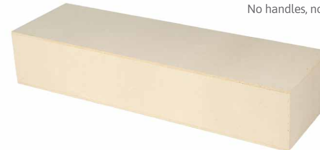
PARTICLE BOARD NORTHERN 10 PB Particle construction Unfinished No handles, no interior