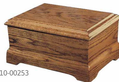
JEWEL BOX VICTORIAVILLE US110-00253