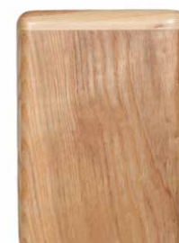
NORTHERN 201 NORTHERN N201