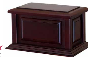
FEDERAL CHERRY COMMEMORATE A205C