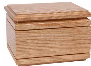
CLASSIC OAK DODGE 950310