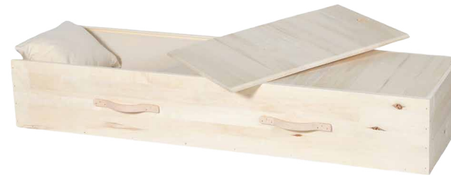
EDEN NORTHERN 102 Solid poplar construction Unfinished Cotton interior