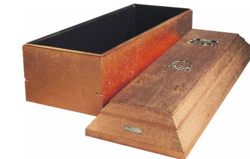
SENTINEL SUPERIOR Reinforced concrete Polystyrene liner in base & cover Butyl sealing tape