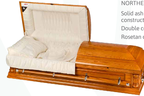
ALASTER SOLID ASH NORTHERN 630 Solid ash and veneer construction Double coat, gloss finish Rosetan crepe interior