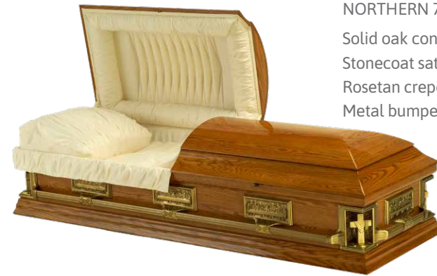
TESTAMENT SOLID OAK NORTHERN 715 Solid oak construction Stonecoat satin finish Rosetan crepe interior Metal bumper handles