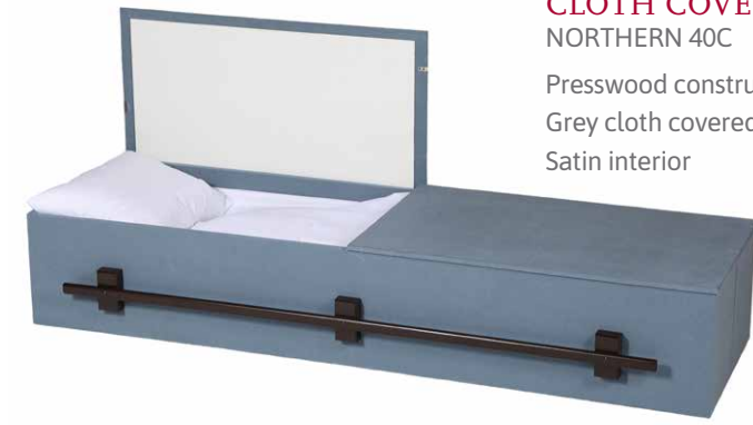
CLOTH COVERED NORTHERN 40C Presswood construction Grey cloth covered exterior Satin interior