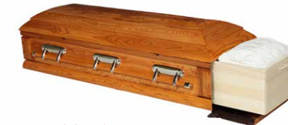
NORTHERN CARLTON RENTAL NORTHERN 33 $1,570