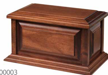
ALLEN VICTORIAVILLE US120-00003