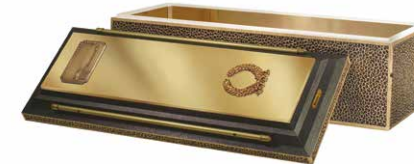
LYDIAN BRONZE SUPERIOR Reinforced concrete ABS and Bronze liner Butyl sealing tape